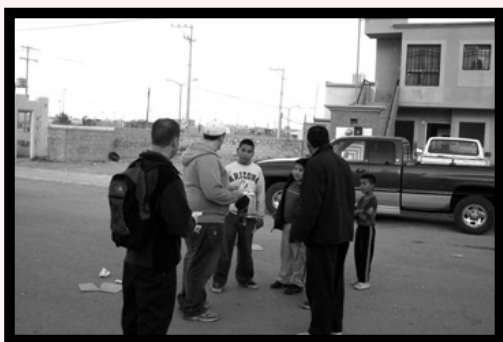
LBC members go into the streets and invite people to VBS.

We had 130 the first day and ended with 175 on Thursday. We had 80 children respond to the invitation on Thursday by making decisions for Christ. It was a blessing to all of us.”