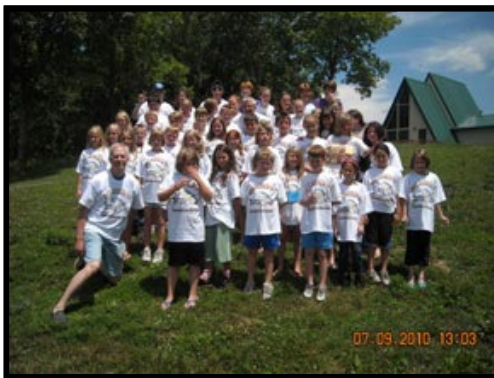
2010 Kids Camp participants from various KCKBA churches.

Wow! What a contrast between this year's camp and last year's camp. Last year, a virus hit 25 people. This year, no one got sick. Last year, there were four bee stings in one day. This year, none all week! Furthermore, there were no serious conflicts between campers, all were compliant with their sponsors, and all went to bed and fell asleep when the lights went out for the night. Most importantly, at least 2 campers received Jesus as Savior because God's presence was real in every worship rally. Children were asking sponsors on their own initiative about getting baptized. What a joy, also, to hear campers praise God and sing in such Spirit-led worship.