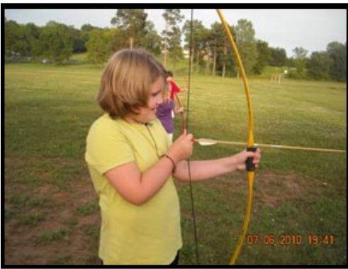
Included among the many camp activities for the week were fishing and archery.